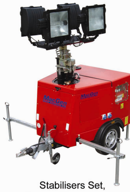
Stabilisers Set, Central Pillar Lowered