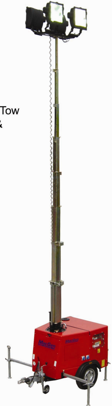
Stabilisers Set, Central Pillar Fully Raised